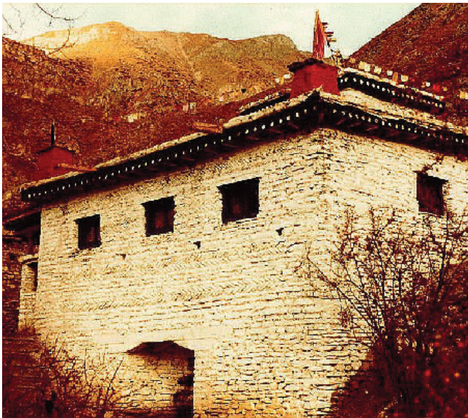
The "Temple Of Miraculous Fire" at Muktinath, Nepal. Photo by Ken Street (Nov. 1979).

[For more on this subject, please read our tract The Temple Of Miraculous Fire .]